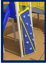
3D Rock Challenge Wall