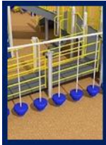
Floating Stones Link