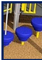
Stepping Stone 4 available