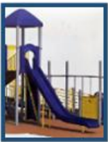
Hypersonic Slide with Roof