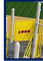
Activity Panel 3 available