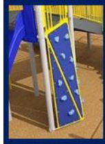
3D Rock Challenge Wall