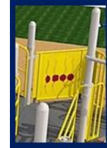
Activity Panel 3 Available