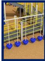
Floating Stones Link